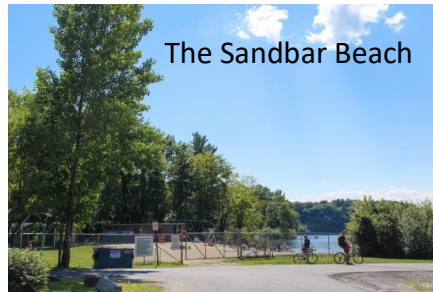
The Sandbar Beach